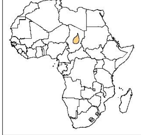
Day 2 Dust forecast 15 March, 2014