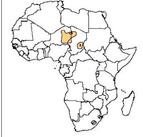
Day 1 Dust forecast 14 March, 2014