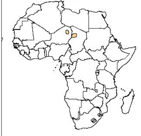
Day 1 Dust forecast 22 March, 2014