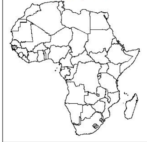
Day 2 Dust forecast 23 March, 2014